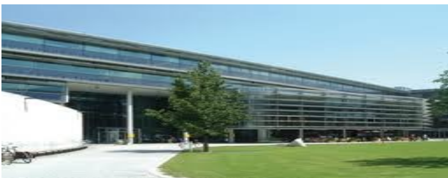
Innsbruck School of Management